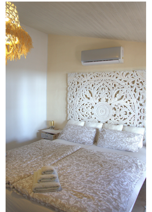
Guest apartment on the first floor with 2 bedrooms, bathroom, kitchen and covered outside terrace.