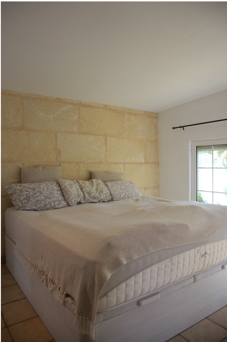
Masterbedroom on the groundfloor with a walkin closet and en suite bathroom.